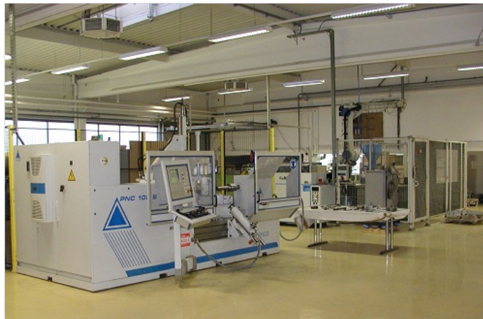
Own Leihfeld spinning machine